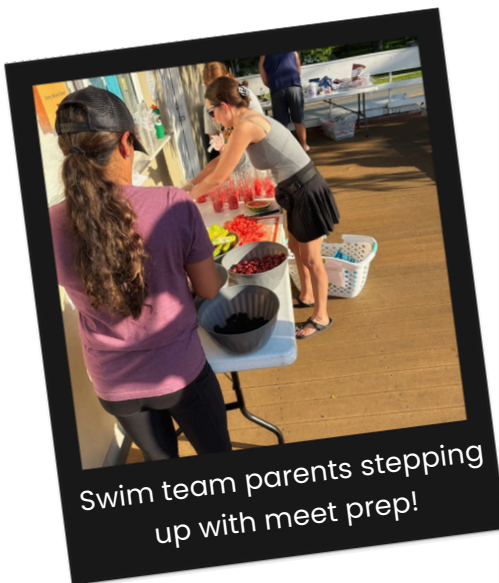
Swim team parents stepping up with meet prep!